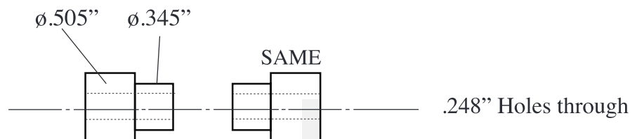
Diagram C / Bushings #PK50RBU